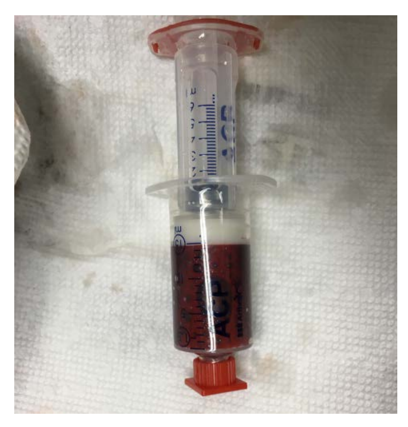
Figure 2 ACP Unit with Blood and ACD