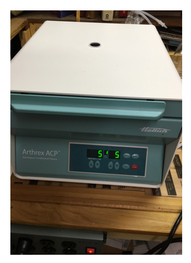
Figure 4 - Ready to Spin