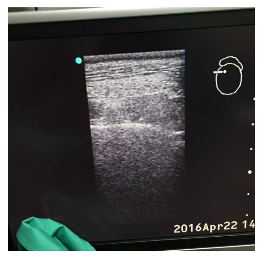
Figure 9 Getting Ready to Inject PRP - Needle just visible upper left below dot