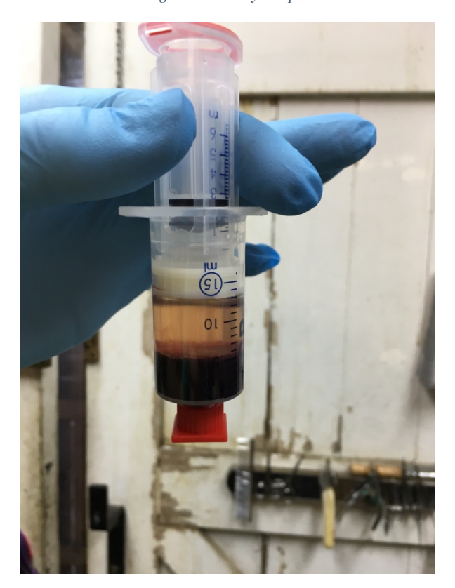
Figure 5 Post Spin PRP Layer - Dual Syringes Still Combined