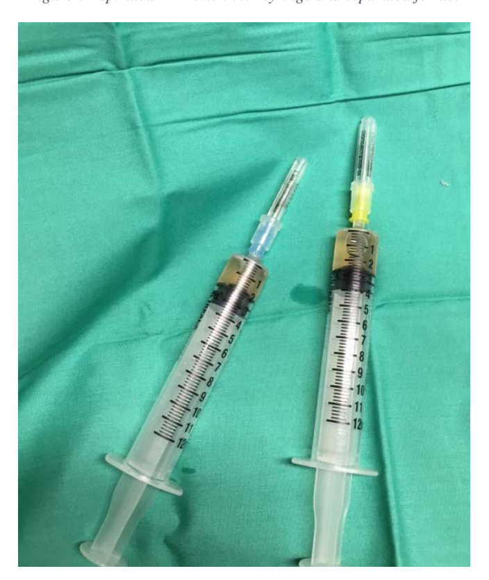
Figure 7 PRP Separated and ozone Activated Pre administration