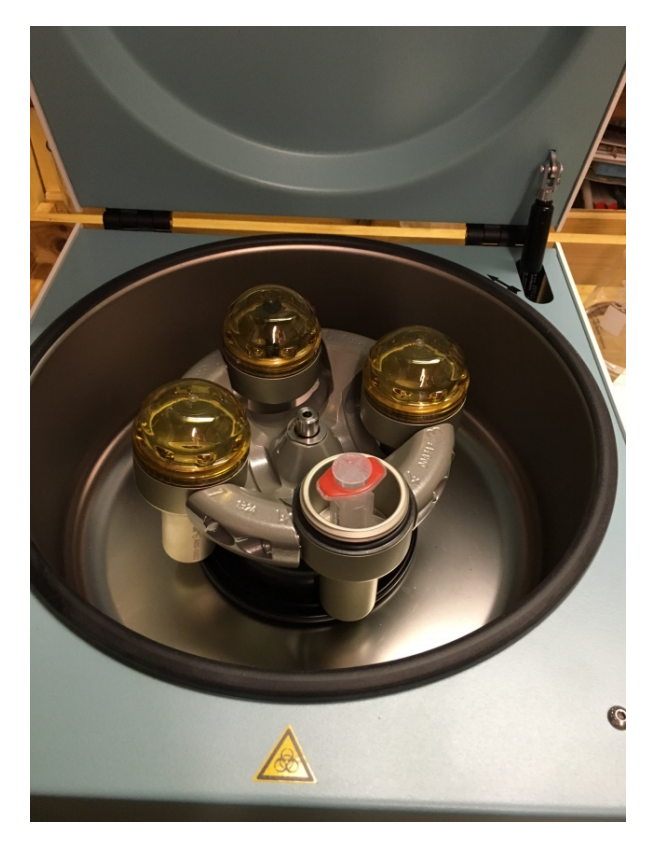
Figure 3 - Sample in Centrifuge pre spin