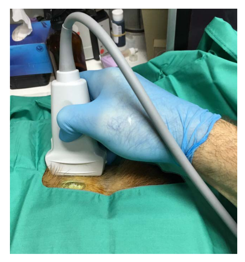
Figure 8 Ultrasound Probe for Injection Guidance