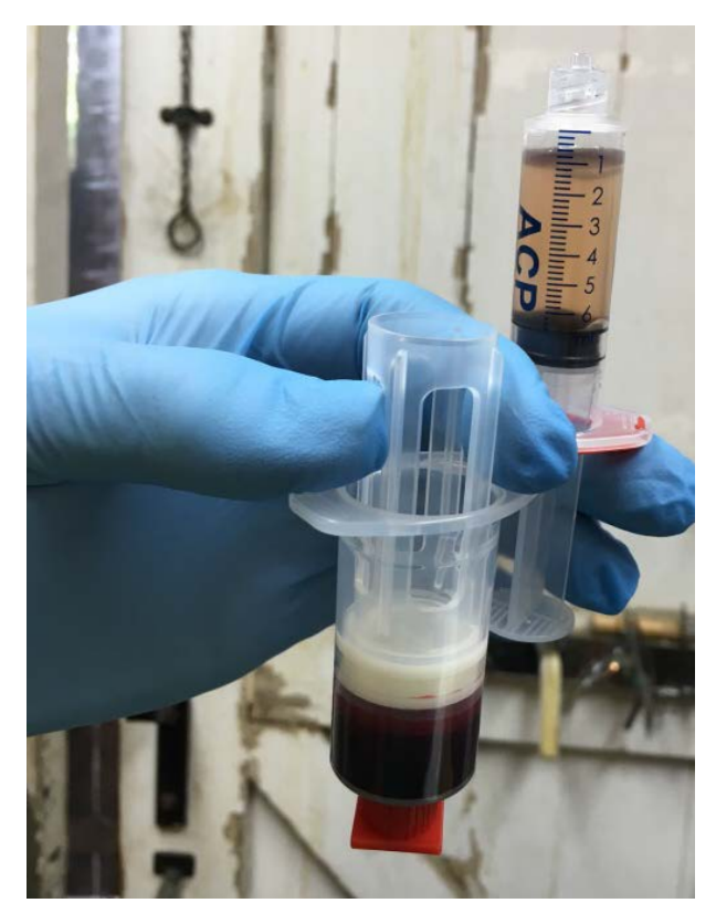
Figure 6 Aspirated PRP into inner syringe and separated for use